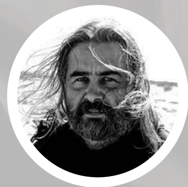
HOYTE VAN HOYTEMA